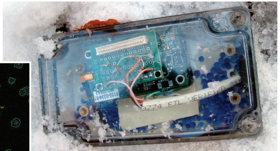
Automated systems will transform data collections, from astronomy (left) to sampling soil properties under our feet.